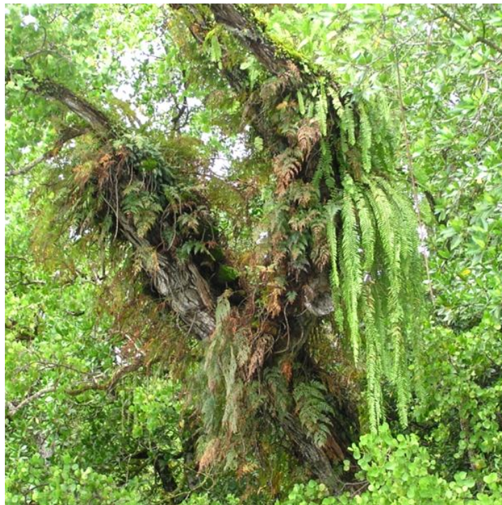
Nephrolepis acutifolia on the island of Pohnpei.

When we were on the island of Pohnpei, we saw Nephrolepis acutifolia growing as an epiphyte in trees everywhere. It is a large fern that you could see hanging from palm trees or hardwood trees all over the island. It, like most Nephrolepis , grows well in high light.