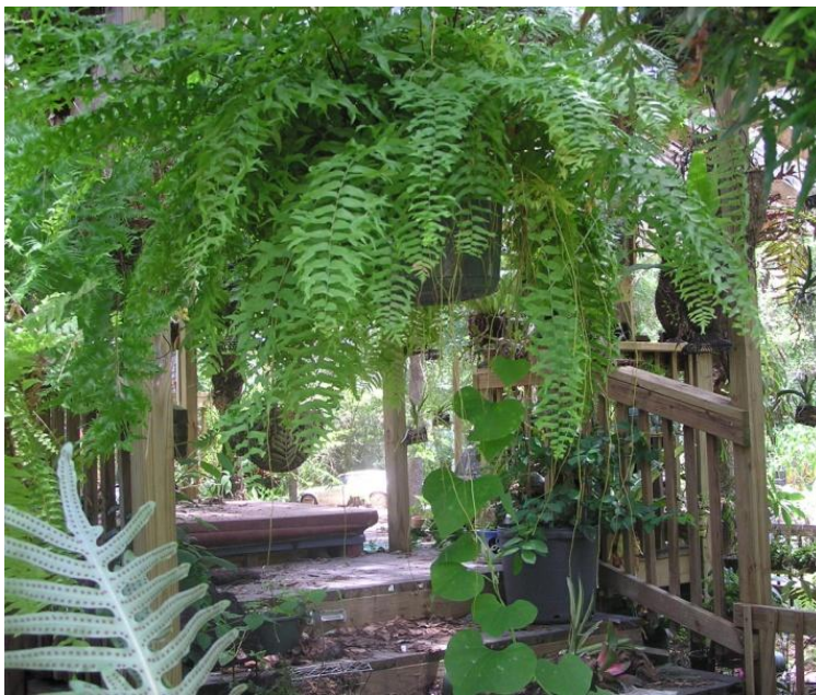
Nephrolepis fish-tail with stolons hanging down.

You can start new plants by taking a cutting of the stolon, the long strings that hang down if you have them in a hanging basket. This is a rhizome that grows very long in search of a place to root into and start a new plant. On the Macho fern ( Nephrolepis falcata ), these stolons can grow 6-7 feet long.