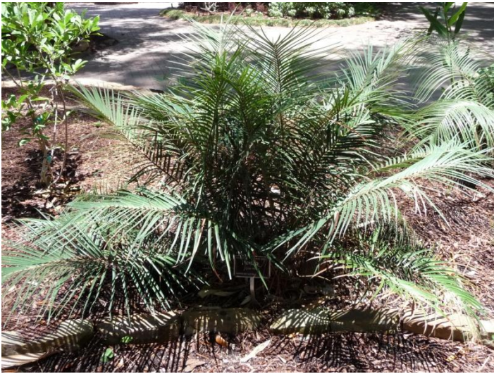
Cycas media – Queensland Australia