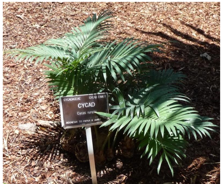
Cycas rumphii – Indonesia to Papua N. Guinea