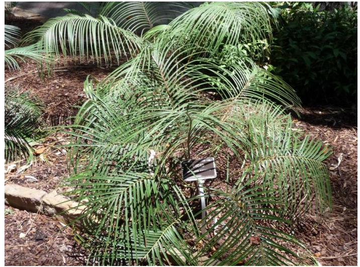
Ceratozamia kuesteriana – Tamaulipas, Mexico